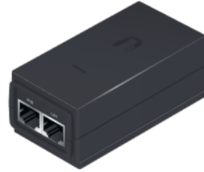
POE-15-12W POE-24-12W POE-24-12W-G