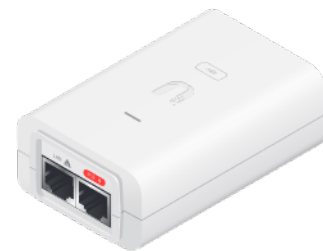
POE-24-24W-G-WH POE-48-24W-WH POE-48-24W-G-WH