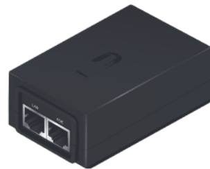
POE-24-24W POE-24-24W-G POE-24-30W